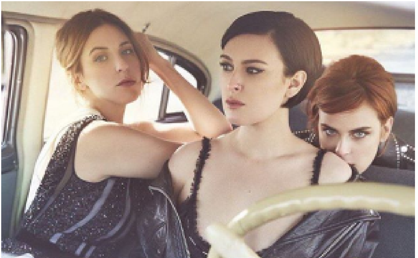
05 May 2016, 11:14am