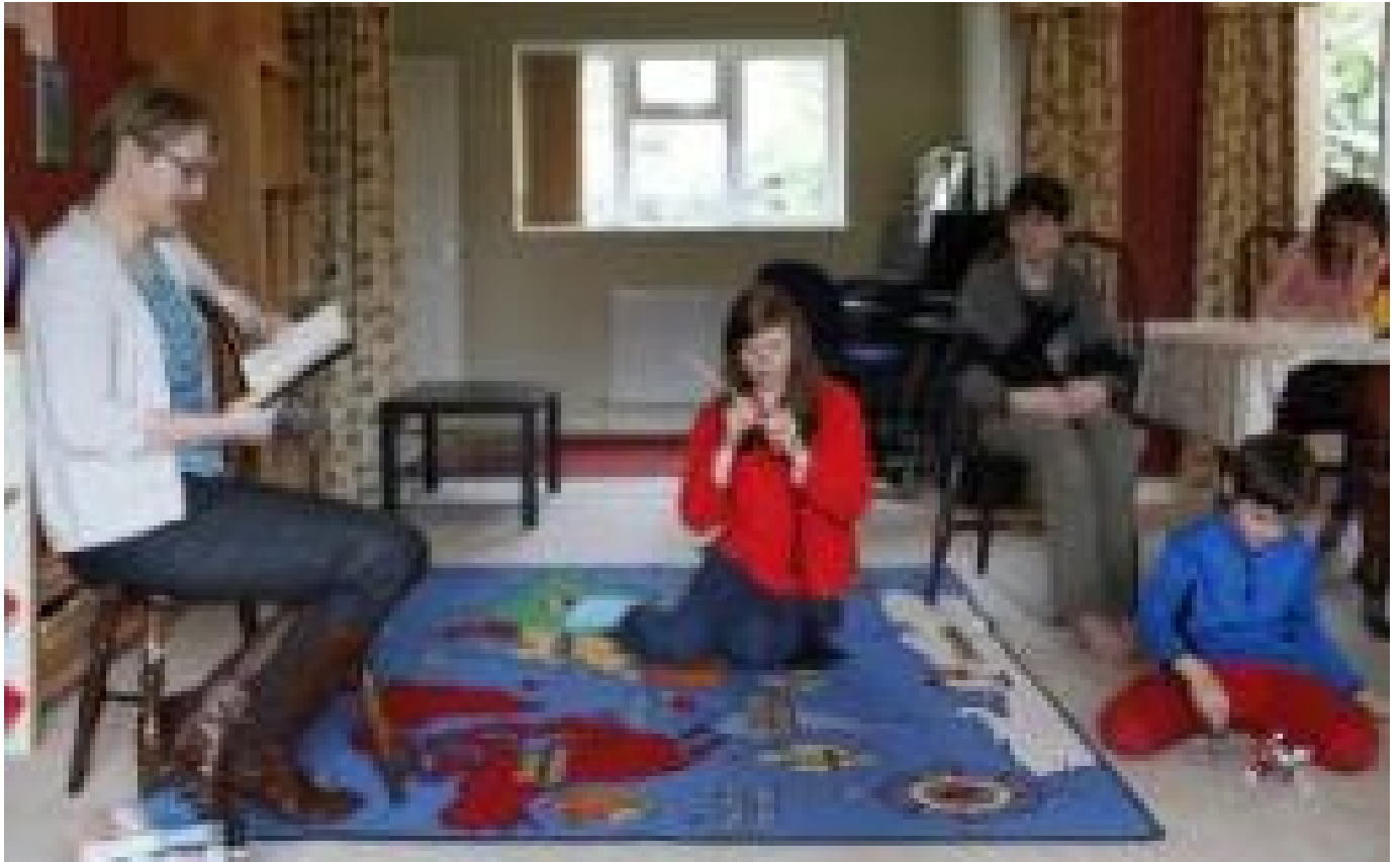
05 May 2016, 3:19pm