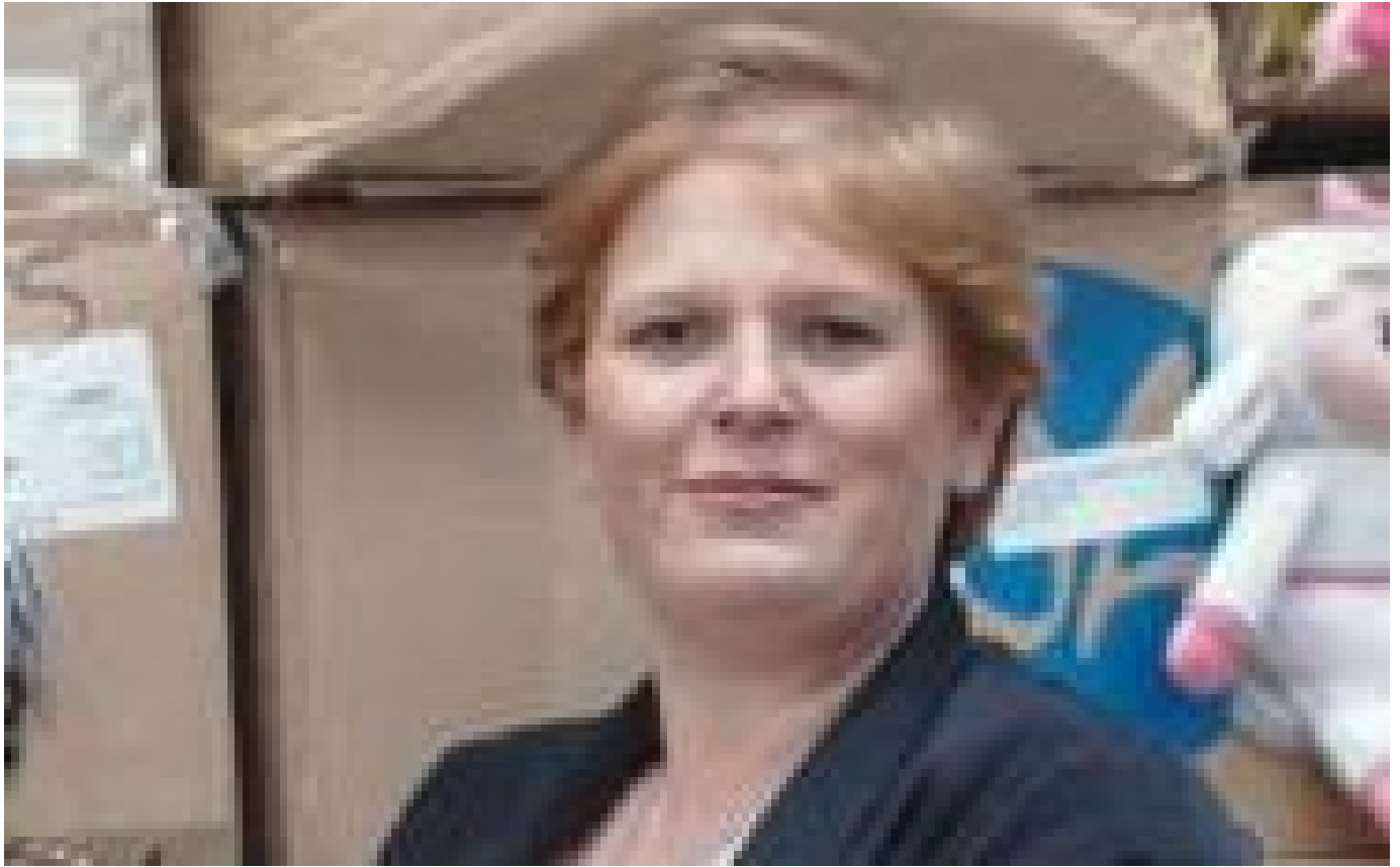
05 May 2016, 12:00pm