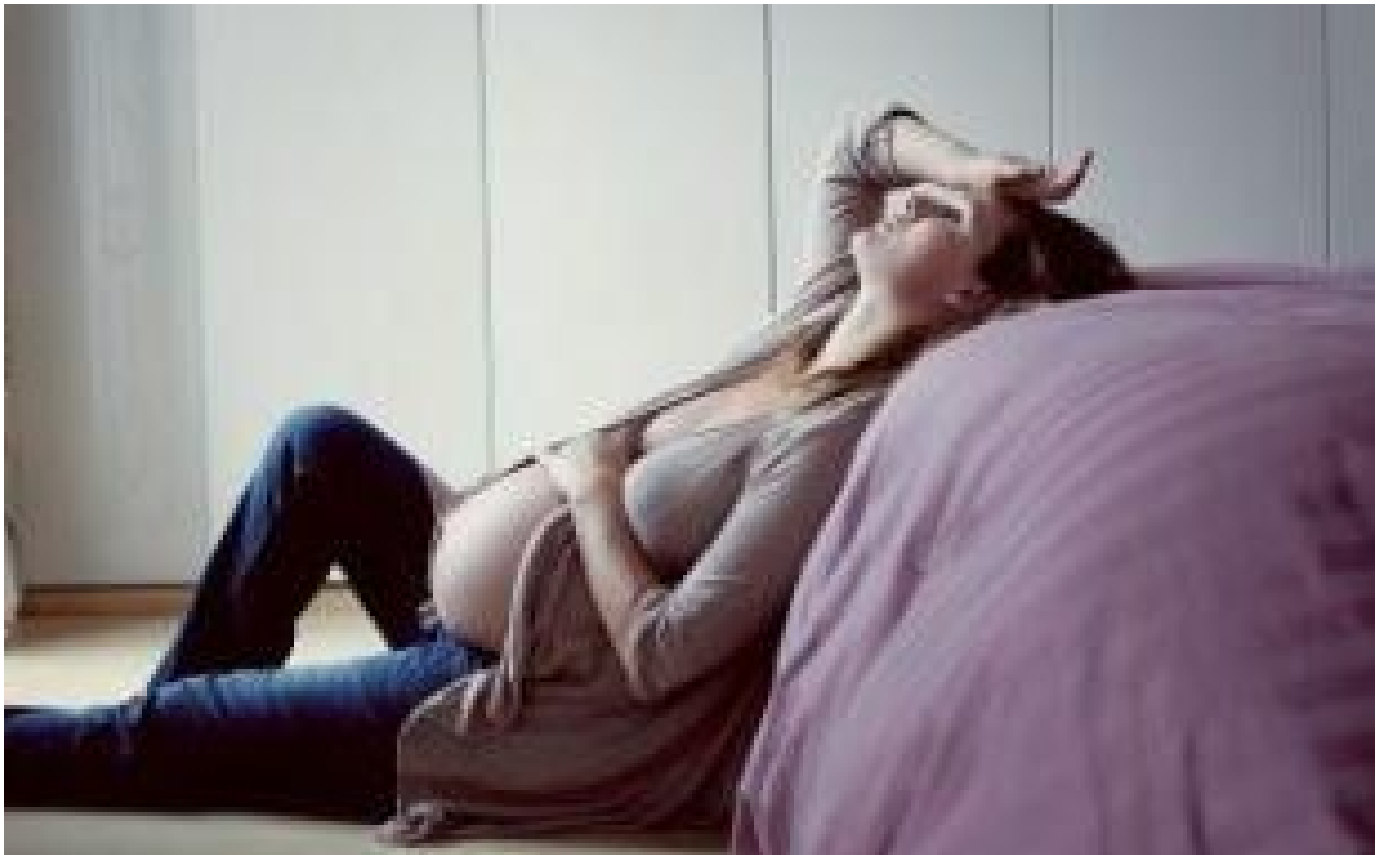
05 May 2016, 1:31pm