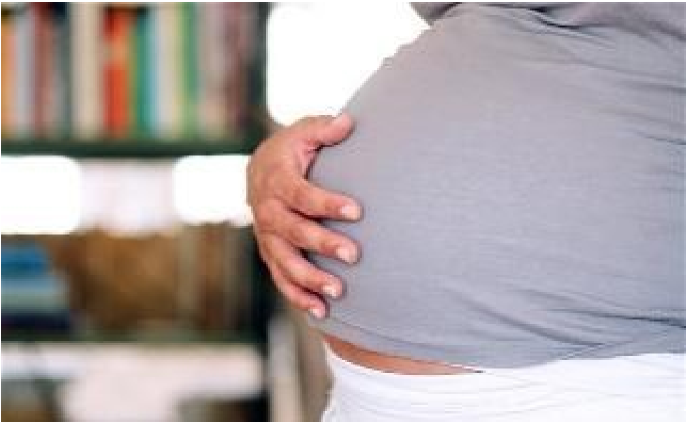
06 May 2016, 6:00am