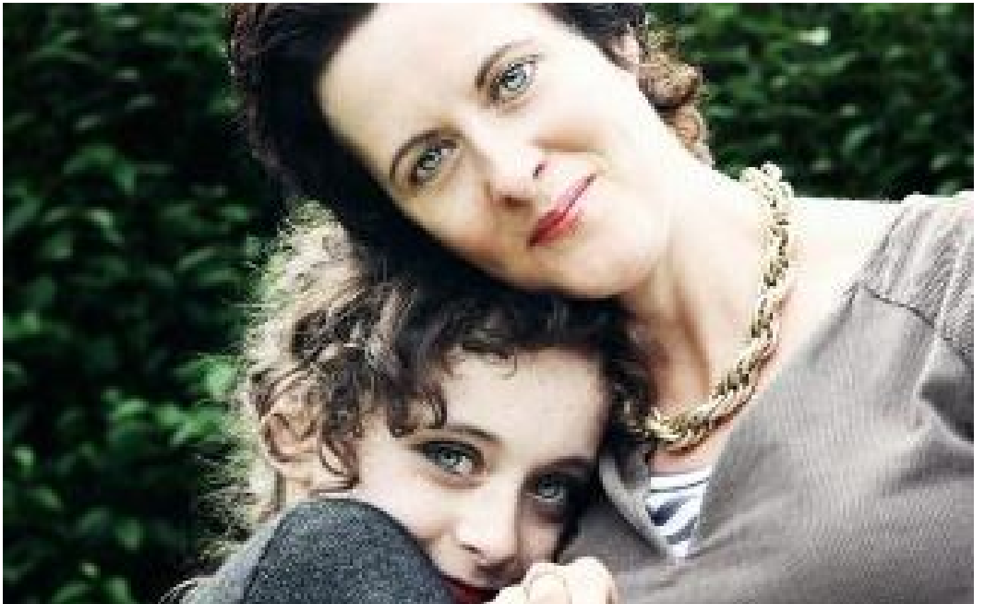
04 May 2016, 4:26pm