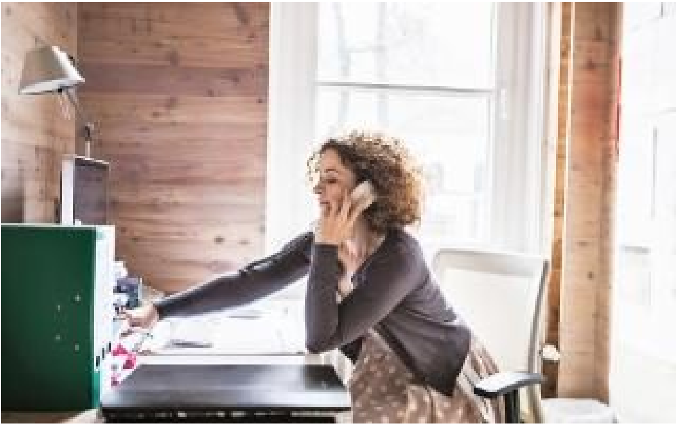
06 May 2016, 7:00am