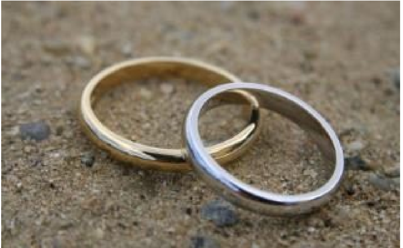
04 May 2016, 5:00pm